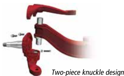
Two-piece knuckle design