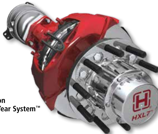
HXL7 ® Hendrickson Extended-Life 7-Year System™ Disc brake version shown