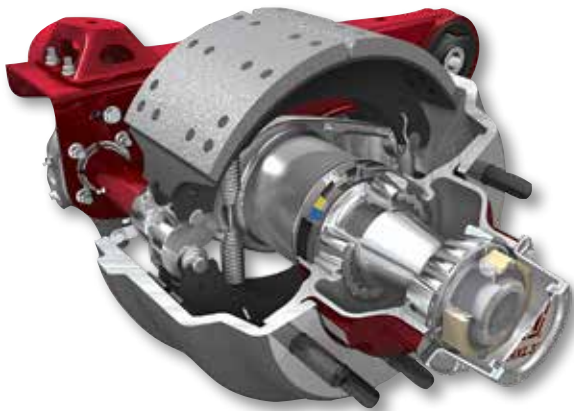
HXL3 ® Hendrickson Extended-Life 3-Year System™