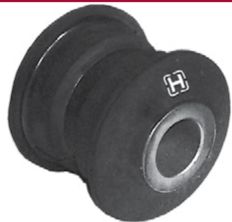
Previous Pivot Bushing

Proper clamp force and use of the correct adjoining components is important for maintaining performance of the pivot bushing. For this reason, the new bushing will be available in the aftermarket ONLY in a service kit. Service Kit number 60961-720 (Table 1) includes the appropriate hardware for the aftermarket installation of the new pivot bushing (2 Service Kits are required for each axle set). Service Kit 60961-720 and additional aftermarket pivot bushing service kits are shown on back page.