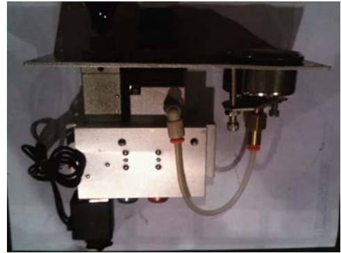
Generation 2 Kit ( 6-dimples )