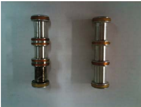
Spools ( Gen 2 on left and Gen 1 on right ) Gen 2 spools will work in Gen 1 kits, but Gen 1 spools will not work in Gen 2 kits.