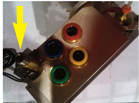
Solenoid Armature Replacement ( 2-screws )