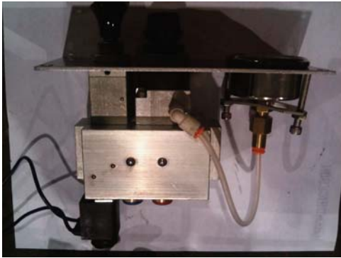
Generation 1 Kit ( 2-dimples )