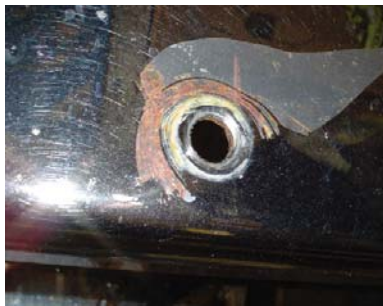
Chrome peeling on face and / or top flange of the bumper

Corrosion chrome or paint peeling / blistering, as shown in the following examples, is covered under warranty