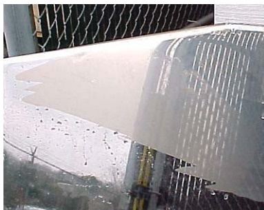
Blistering on face and / or top flange of the bumper