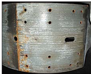
Hendrickson AAXTREME COAT