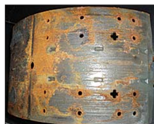
Competitor Premium Coating