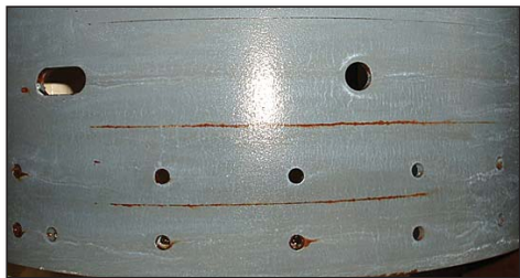
Hendrickson AAXTREME COAT

AAXTREME COAT premium brake coating withstood over 1,000 hours of salt spray testing and rigorous cyclic corrosion testing designed to mimic real-world environmental conditions.