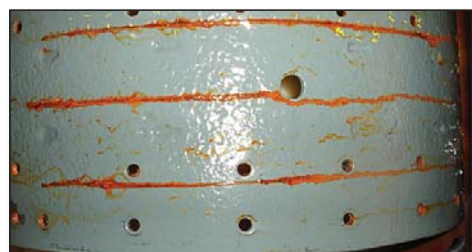
Competitor Premium Coating